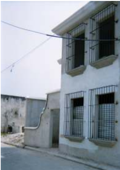
The Safe House- near completion