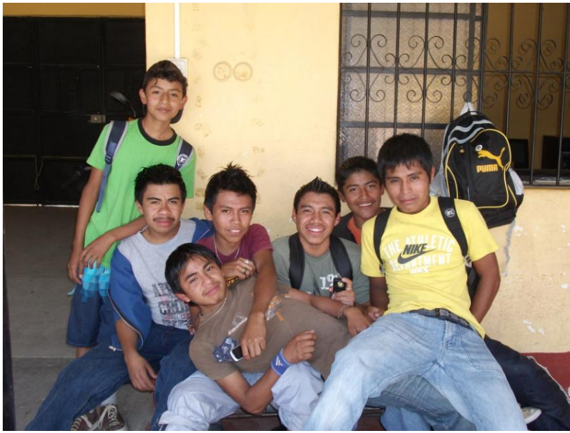
Some of the students on our Scholarship Programme

We aim to ensure every one of our young people has the opportunity to continue on to higher education through our Scholarship Programme. We need the support and generosity of businesses to make this happen. If you would like to help our Scholarship Programme please do not hesitate to get in touch.