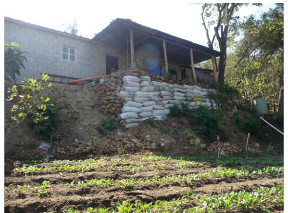
One of the houses we built

The cost of moving a family and building a dry safe house is approximately £3,000.