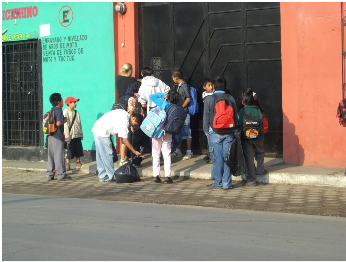
'Escuela Proyecto La Esperanza'

In early December 2004, we found a large empty unit in the centre of Jocotenango, a poor area adjoining Antigua. Although the unit costs were a lot higher than before, we committed to it. On 17 th January 2005, Escuela Proyecto La Esperanza opened its doors for the first time to 150 children.