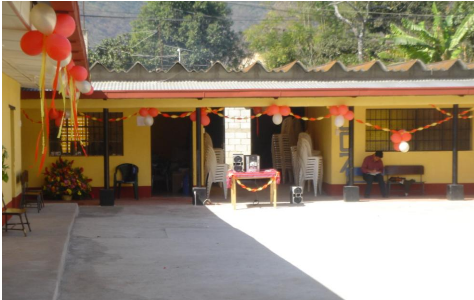
'Escuela Proyecto La Esperanza - Nivel Basico, Opening Day'

By 2007, the Foundation had attracted a great deal of support. We had found many dedicated supporters and our sponsorship programme had given us enough guaranteed annual income to contemplate expansion.