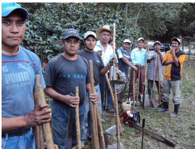
Some of the men helping to build our new school in 2010 - many of them have children in our schools

In 2009 we continued to rent our existing Primary School while we looked for an alternative. After nearly a year of searching for the ideal premises we found The Azotea. We were incredibly lucky to get further financial support from the Premier League which enabled us to buy this wonderful piece of land.