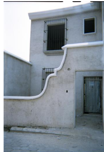
The 'Safe House'

There are 6 other children who previously stayed with us in the safe house and have now been reunited with family members.